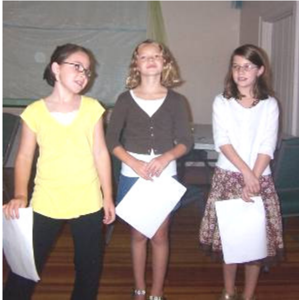
Sunday School Bible Verse Recital Collected many dollars for the children's special donations and projects